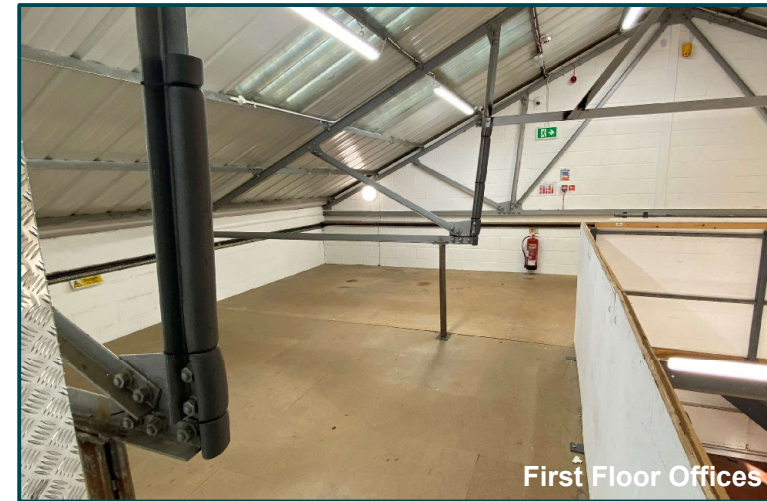
First Floor Offices