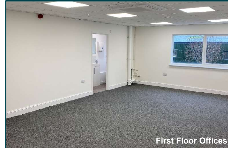
First Floor Offices